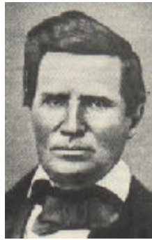
Alexander Doniphan American Lawyer & Soldier