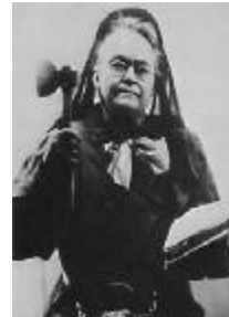
Carrie Nation Bar Room Smasher