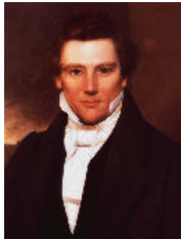
Joseph Smith Prophet of the Mormon Church