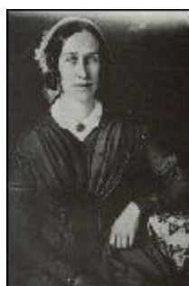
Clarina Nichols Passionate Advocate for Women's Rights