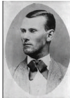
Jesse James Outlaw