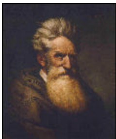
John Brown Abolitionist