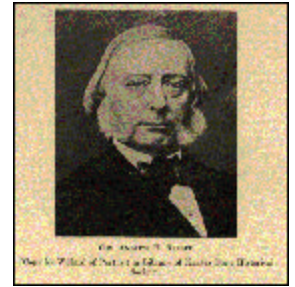
Andrew H. Reeder First Territorial Governor