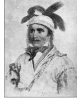
Opothleyahola Muscogee Creek Indian Leader Fought for the Union in the Civil War