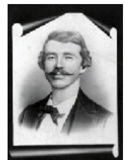
William Clarke Quantrill Leader of Guerilla Warfare