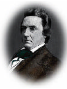
David Rice Atchison MO Senator & US President for One Day