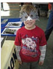
JAS-NextGen :: Wakarusa