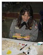
Clinton Lake's US Army Corps/Wakarusa Watershed Marshal Wakarusa Wetland Learners