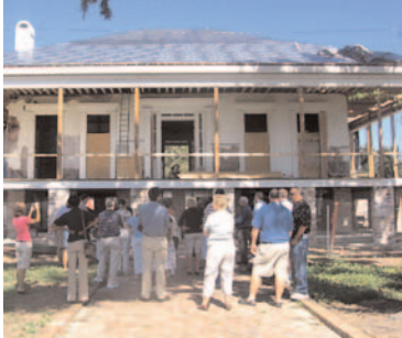
Historic Beauvoir House, home of Jefferson Davis, suffered severe damage during Hurricane Katrina. Efforts are now underway to rehabilitate the structure.