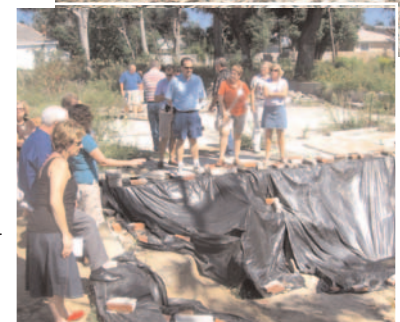
ANHA Board members visit a recently discovered 1701 cemetery site in the city of Biloxi, MS.