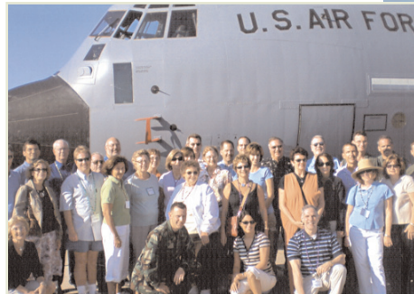
The ANHA Board of Directors was given rare access to a U.S. Air Force C-130 during a special tour of Keesler Air Force Base, home of The Hurricane Hunters.

On Thursday and Friday, the ANHA Board held its business meetings, with both general sessions as well as more specialized meetings geared towards the concerns of specific board committees. Board Members also heard an update on international partnerships between the ANHA and heritage-development oriented organizations in other countries.