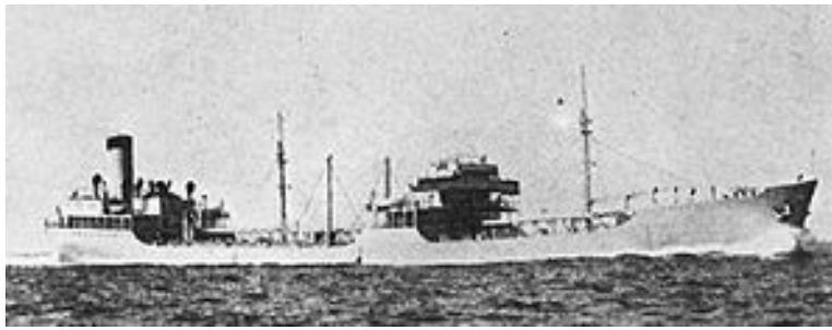
USS Neosho (AO-143), the lead ship of the Neosho-class oilers (1954).